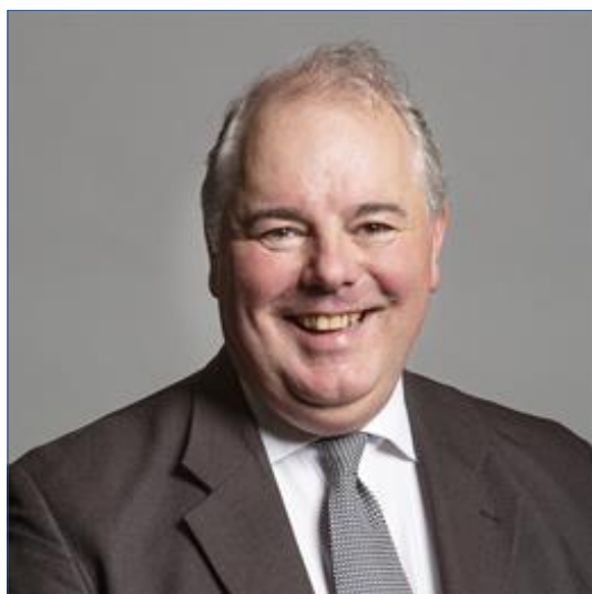
Richard Bacon MP, Chair of the All-Party Parliamentary Group on Self-Build, Custom and Community Housebuilding and Place-Making

As part of the action plan, the government commissioned the Independent Review into Scaling up Self Build and Custom Housebuilding led by Richard Bacon MP, Chair of the All-Party Parliamentary Group on Self-Build, Custom and Community Housebuilding and Place-Making. Updated in July 2023 2 , the report’s recommendations include raising awareness of the right to build, promoting greener homes, increasing the use of advanced manufacturing; and introducing planning reforms to support self and custom housebuilding.